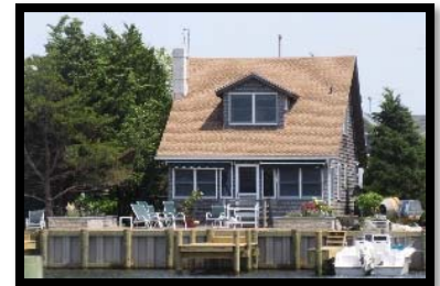
9 Kinsey Lane

Stroll down the streets of Harvey Cedars between 83 rd and Lee Avenue and visit 5 small cottages built between 1906 and 1940, plus the 1929 Barnegat Light Yacht Club. Water, rest stop and historical photos and documents at the High Point Firehouse on 80 th Street.