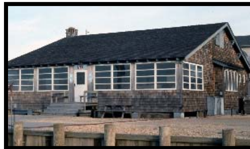
Barnegat Light Yacht Club